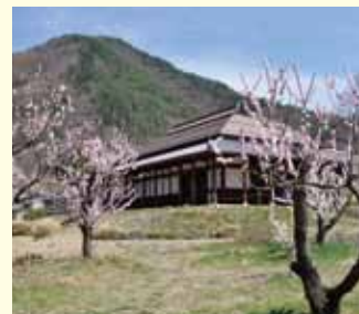
Anzu no Sato Sketch Park [あんずの里スケッチパーク]

Gaze upon the pastel pink apricot flowers that densely cover the branches of the trees and together create magnificent views. Take a stroll through the sweetly fragrant apricot trees and experience for yourself the arrival of spring.