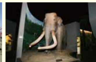
Nagano Prefectural Museum of History [長野県立歴史博物館]

Experience the ancient village life of the Shinano region by walking among the excavated houses, storehouses and ceremonial grounds of the Kofun Period.