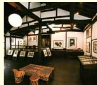
Anzu no Sato Woodblock Print Museum [杏の里板画館]

Precious old apricot trees have been relocated to the park and historical houses have been restored to recreate a traditional village. Home to magnificent spring flowers, first the apricot flowers bloom, and then the cherry blossoms.