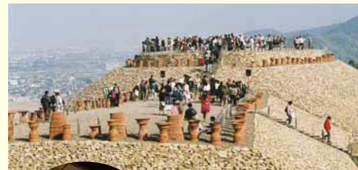
Mori Shougunkzuka Old Tomb [森將軍塚古墳]

Located within a historic house from the Edo Period, the museum's exhibits include folklore artifacts from the Shinshu region and works by Munakata Shiko, an internationally recognized 20th century woodblock print artist.