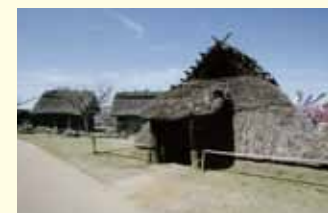
Shinano no Mura [科野のムラ]

Experience the ancient village life of the Shinano region by walking among the excavated houses, storehouses and ceremonial grounds of the Kofun Period.